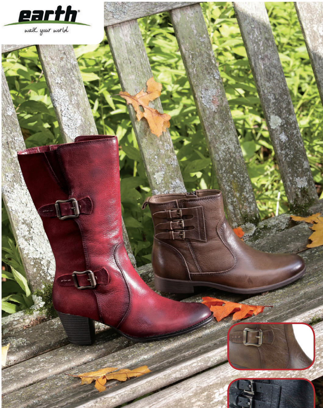
LARCH in bordeaux (left). Also available in taupe. NORWAY in taupe (right). Also available in black.

Go rustic with one of Earth's beautiful boots. Larch and Norway's burnished leather and exquisite buckles will complement everything from your cutest dress to that fun, new pair of jeans. Let Earth be your guide for every country excursion or day downtown.