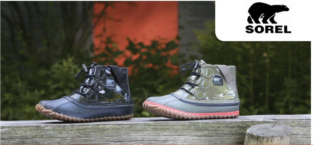
OUT N ABOUT GLOW in black and peat moss.

You'll hope for snow with Sorel's Out N About Glow. Its waterproof patent synthetic upper, cotton lining and vulcanized rubber and herringbone outsole hit all the marks for comfort and function, while managing to mix a carefree cool with puddle-splashing pleasure. Relish your snow, rain or slush dance with Sorel.